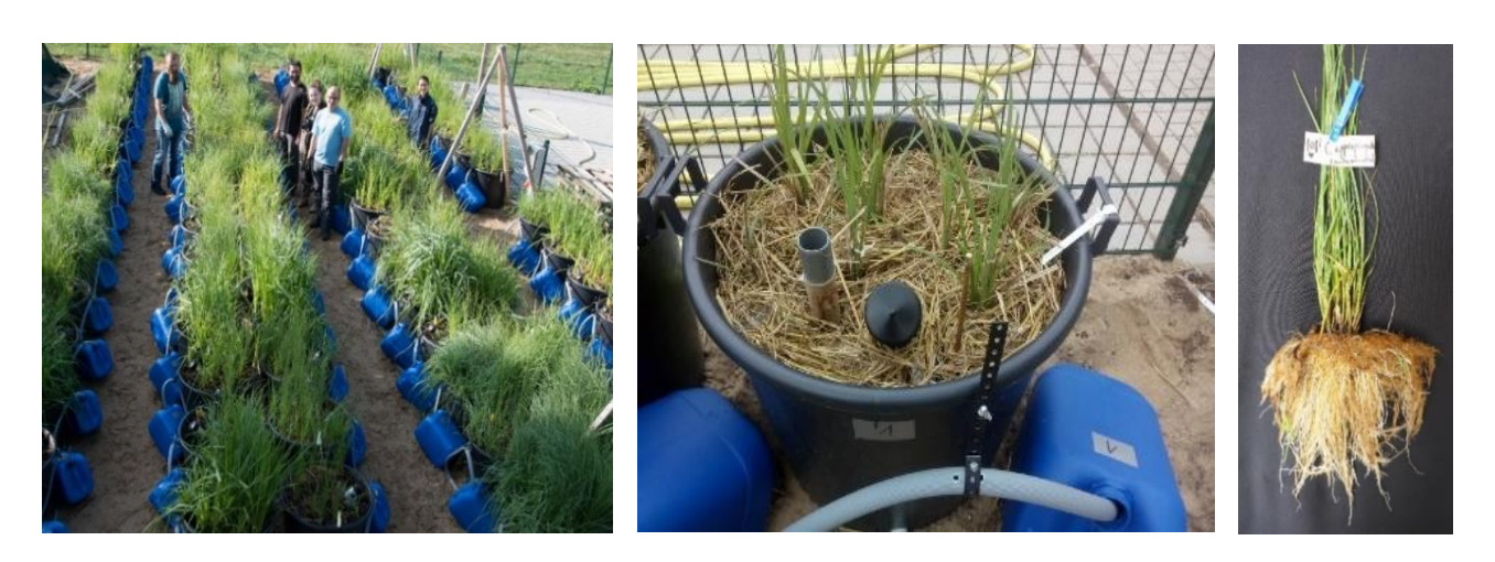
Left and centre: Set up of pots for the trial on peat forming potential of sedges. Right: Carex appropinquata whole plant (above and below ground biomass)