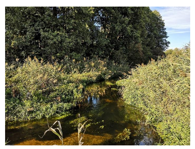
Riparian wetland in the Neman catchment area, Poland.

necessary to rewet drained peatlands, but first of all to protect the intact ones.